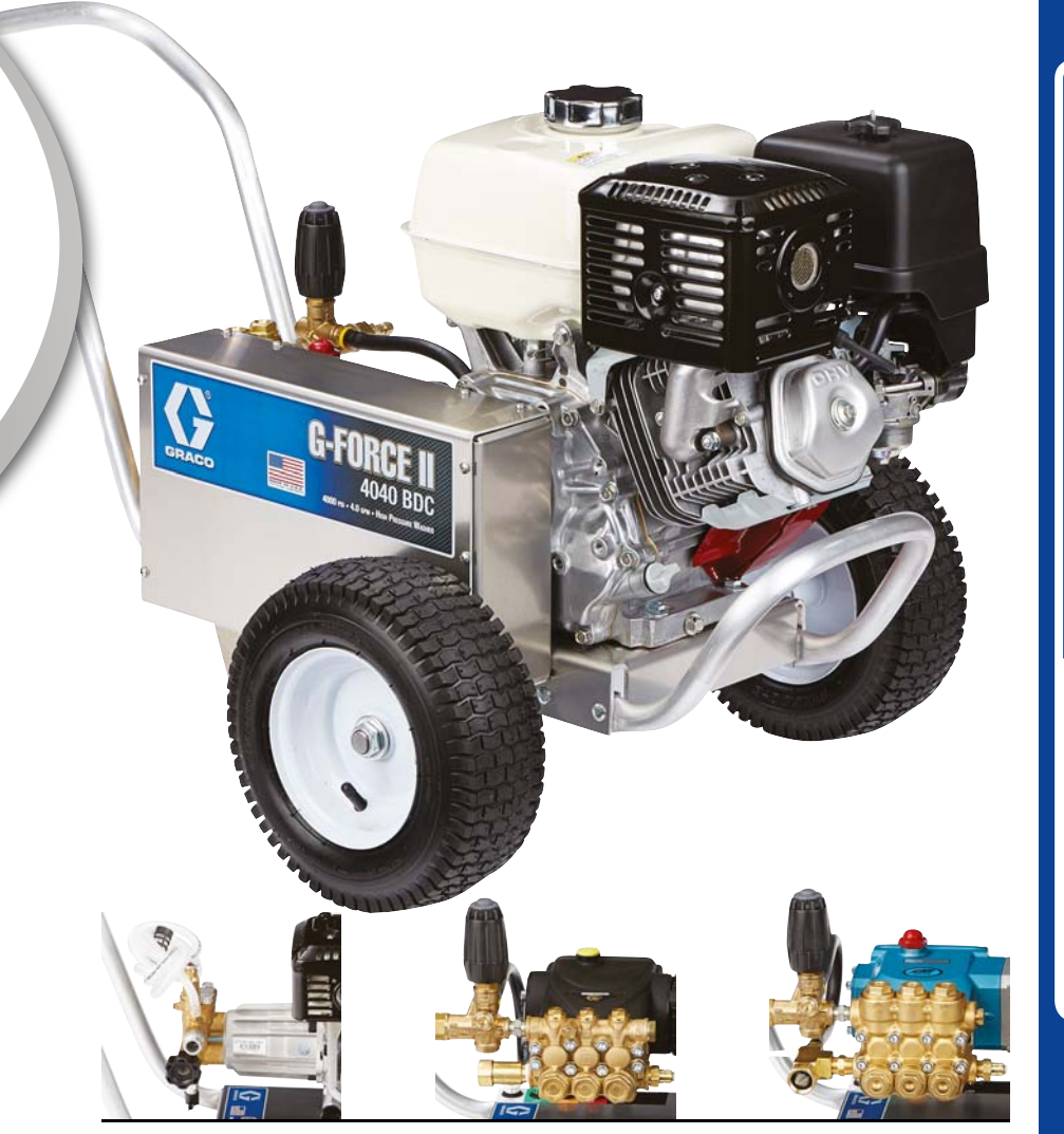
Chemical Injector Kit Add chemicals for heavy duty cleaning jobs

Aircraft Grade Aluminium Frame - Up to 40% lighter - Corrosion resistant to water and chemicals